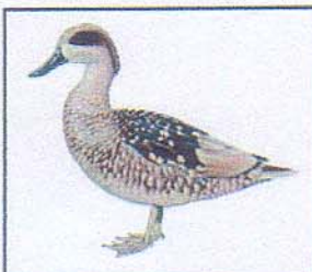
European marbled teal ( Marmaronetta angustirostris )

ers ( Anas clypeata ), red crested pochards ( Netta rufina ), common pochards ( Aythya ferina ) and green-winged teals ( Anas crecca ). These wetlands, along with El Hondo, shelter 80% of the European marbled teal ( Marmaronetta angustirostris ) population, clas-