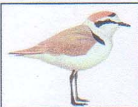
The kentish plover ( Charadrius alexandrinus )

wading birds in the whole Autonomous Community of Valencia during the migration and winter seasons. These include the avocet ( Recurvirostra avosetta ), the black-tailed godwit ( Limosa limosa ), several species of sandpipers,